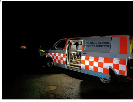
The new incident support vehicle in use on Rescue 39.

disoriented in the complex system. It was just as dark underground as it was on the surface!