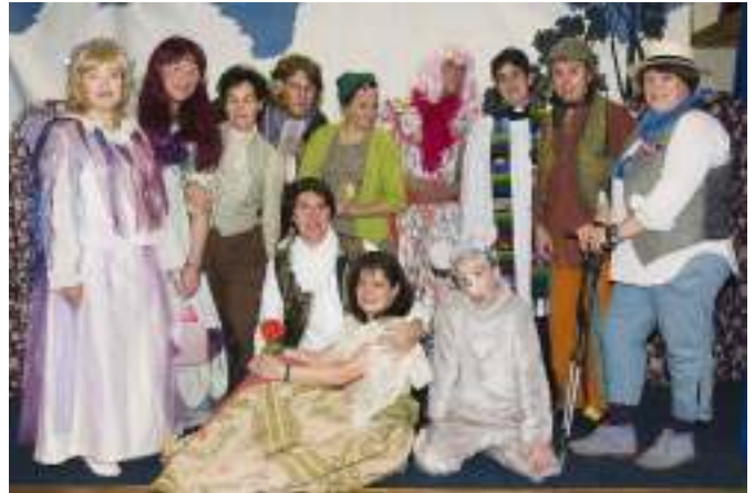
The cast of Beauty and the Beast

collection of poems based on the Museum and its collection.