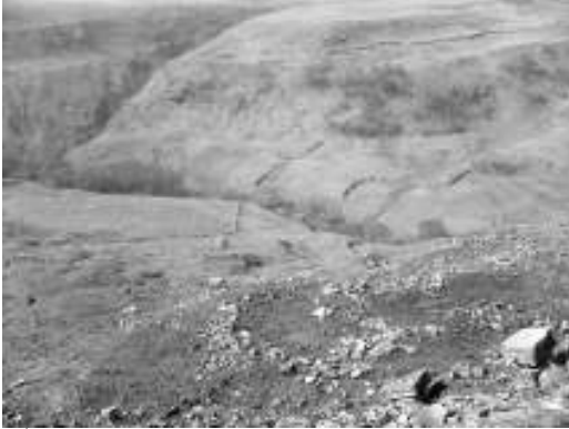
Remains of a round house below Dickie Edge