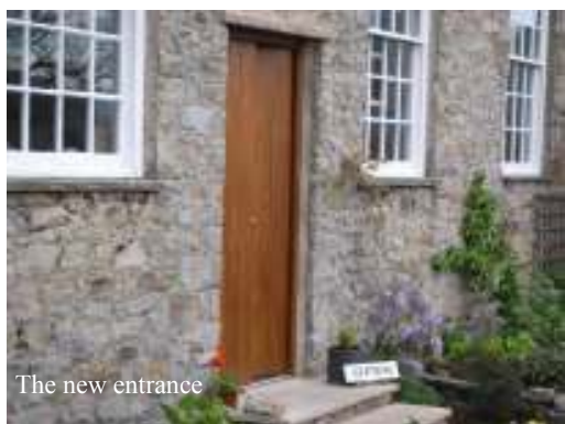
The new entrance