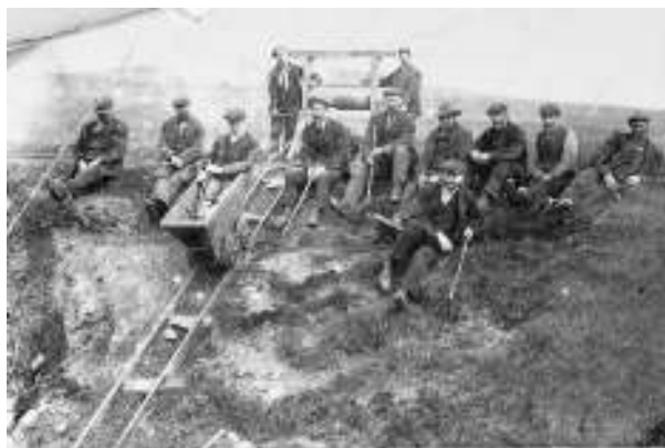
19th Century Arkengarthdale Lead Miners