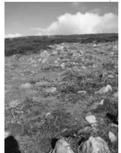
Robbed out Boundary wall on Calver Hill